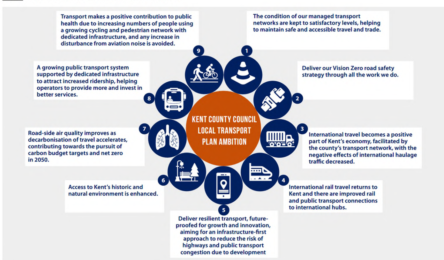
Figure 1 – Proposed policy outcomes from our draft Local Transport Plan

The consultation runs until 18 September 2023 . The consultation document and questionnaire are available through the following link: